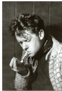
Dylan Thomas

Llywodraeth Cynulliad Cymru Welsh Assembly Government