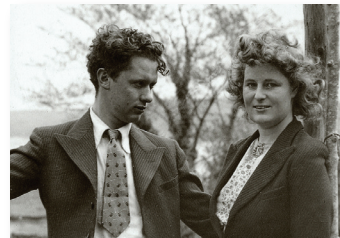
Dylan Thomas and Caitlin